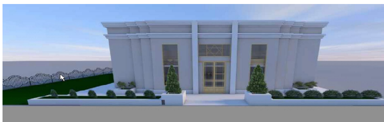
Our Future Home on Rosser