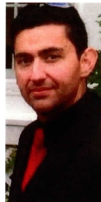
Jewish Funeral Director